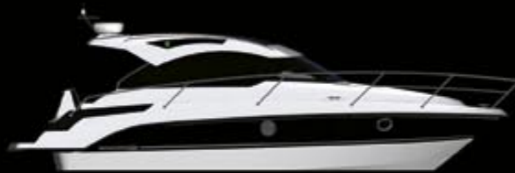
DARK GREY (optional)